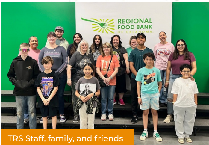
TRS Staff, family, and friends

TRS staff, friends, and family helped sort and pack 423 boxes of bread to distribute to our community. The total pounds packed was 5,499, which is equivalent to 4,583 meals! It was a good day!