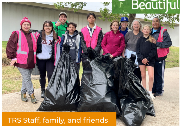
TRS Staff, family, and friends

During Earth Day, our TRS staff, friends, and family were able to collect about 5 trash bags full of litter along a mile stretch of the Oklahoma River. Thank you for keeping our community beautiful!