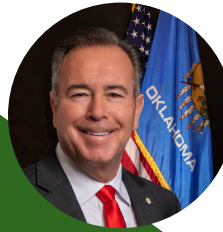
STATE TREASURER TODD RUSS

“With revenues rebounding nearly 18% from August and growing year-over-year, the state’s fiscal picture shows encouraging momentum. Strong income and energy tax revenue continue to anchor Oklahoma’s economy, even as sales activity softens.”