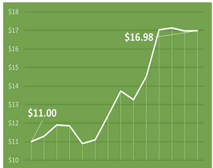
12-MONTH END 2012 - 2025 (in billions)