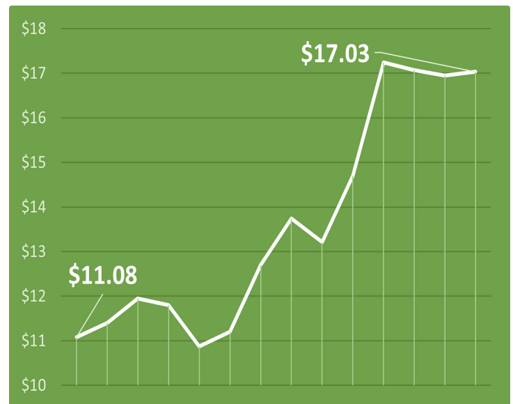
12-MONTH END 2012 - 2025 (in billions)