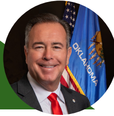
STATE TREASURER TODD RUSS

"The rebound in sales and use tax also reflects continued consumer confidence heading into the holiday season. With federal data still delayed from the shutdown and the Fed's recent rate cut based on the latest private-sector indicators, we are watching national trends closely."