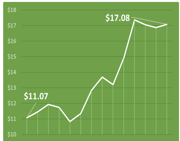
12-MONTH END 2012 - 2025 (in billions)