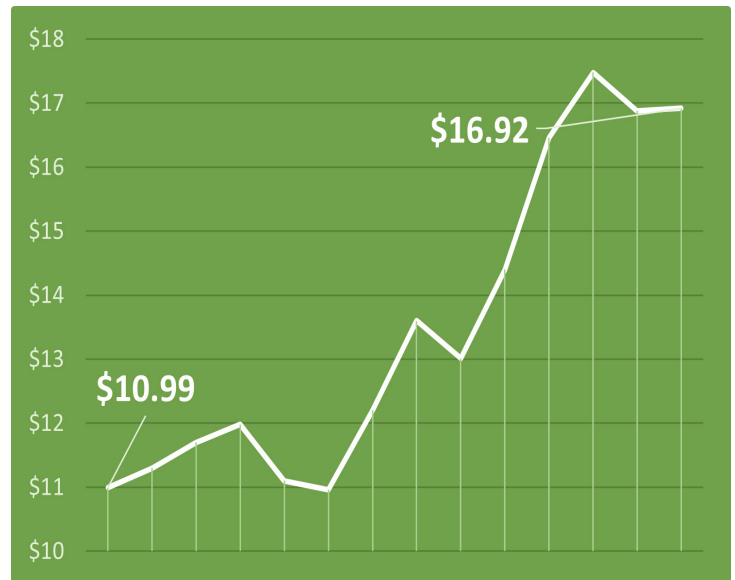
12-MONTH END 2012 - 2024 (in billions)