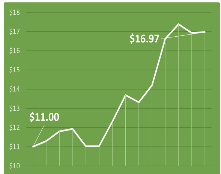
12-MONTH END 2012 - 2024 (in billions)