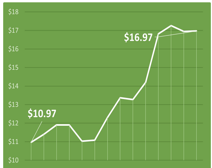
12-MONTH END 2012 - 2025 (in billions)