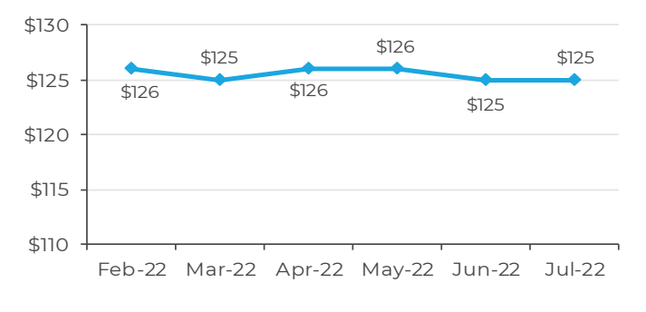
Average OHCA Premium Assistance Payments