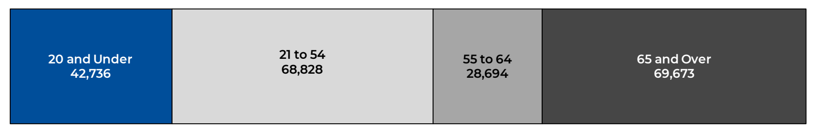
TPL by Age

Unless otherwise stated, CHILD is defined as an individual age 18 and under. TPL counts include those with the following coverage types: hospitalization, medical, major medical, Medicare supplemental insurance Part A and/or B and skilled or intermediate care in a nursing facility. This publication is authorized by the Oklahoma Health Care Authority in accordance with state and federal regulations. OHCA is in compliance with the Title VI and Title VII of the 1964 Civil Rights Act and the Rehabilitation Act of 1973. For additional copies, you can go online to OHCA's web site <a href="https://www.okhca.org/research/data">www.okhca.org/research/data</a>). The Oklahoma Health Care Authority does not discriminate on the basis of race, color, national origin, gender, religion, age or disability in employment or the provision of services. Data is compiled by the Office of Data Governance & Analytics as of the report date and is subject to change.