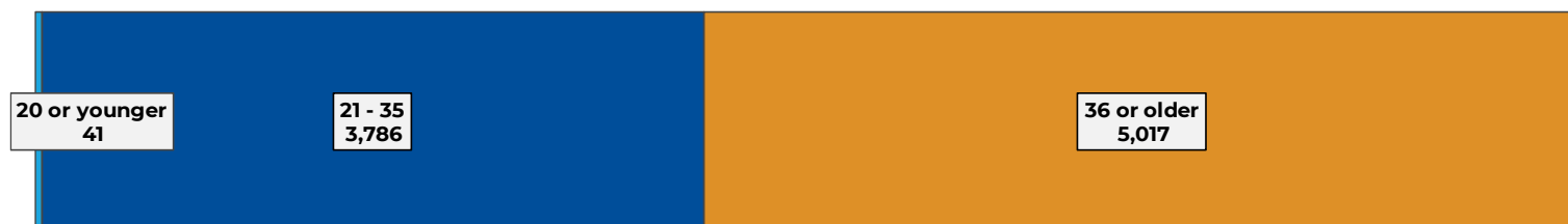
Age Breakdown of Total SoonerPlan Enrollment

This publication is authorized by the Oklahoma Health Care Authority in accordance with state and federal regulations. OHCA is in compliance with Title VI and Title VII of the 1964 Civil Rights Act and the Rehabilitation Act of 1973. For additional copies, you can go online to OHCA's website www.okhca.org/research/data . The Oklahoma Health Care Authority does not discriminate on the basis of race, color, national origin, gender, religion, age or disability in employment or the provision of services. Data was compiled by the Office of Data Governance & Analytics and is valid as of the report date and is subject to change.