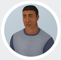
Antoine: Screen for mental health and substance use

Learn effective techniques to discuss mental health and substance use with adult patients in a primary care setting.