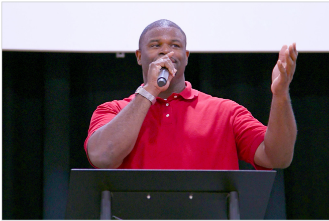
Oklahoma Fatherhood Summit