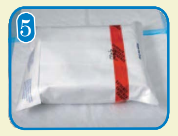
Seal the opening of this envelope with a continuous piece of evidence tape. Write initials half on the evidence tape and half on the enevelope.