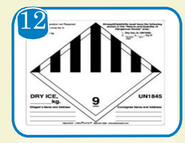
Place a Class 9/UN 1845 label on the front of the shipper. This label for dry ice MUST indicate the weight of dry ice (in kg) in the shipper and the proper name (either dry ice or carbon dioxide, solid).