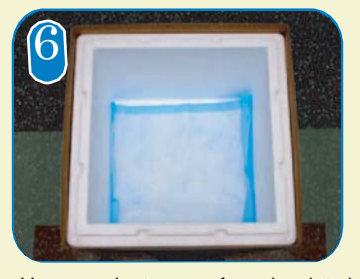
Use polystyrene foam-insulated, corrugated fiberboard shipper to ship boxes to CDC. Place absorbent pad in the bottom of the shipper.