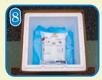
Place the packaged urine cups in the shipper. Use absorbent material or cushioning material to minimize shifting while box is in transit. Place additional dry ice on top of samples.