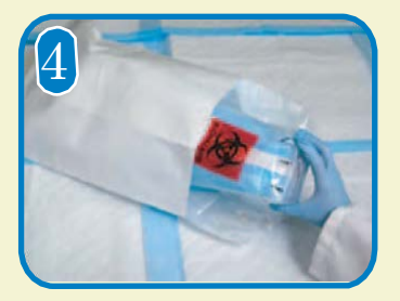
Place the sealed Saf-T-Pak inner leakproof polybag (or equivalent) inside a white Tyvek ® outer envelope (or equivalent). Note: If primary receptacles do not meet the internal pressure requirement of 95 kPa, use compliant secondary packaging materials.