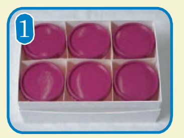
Place urine cups in a gridded box lined with absorbent material, or alternatively place each cup inside a leak-proof biohazard polybag (or equivalent) and then place wrapped urine cups into a box.

Guidance in Accordance with Packaging Instructions International Air Transport Authority (IATA) 650 Biological Substance Category B. See "Chemical Agents: Shipping Instructions for Specimens Collected from People who May Have Been Exposed to Chemical Agents" http://emergency.cdc.gov/labissues/specimens_shipping_instructions.asp