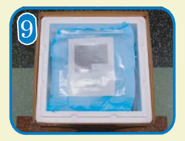
Place the urine shipping manifest in a sealable plastic bag and put on top of the sample boxes inside the shipper. Keep your chain-of-custody documents for your files. Place lid on the shipper.