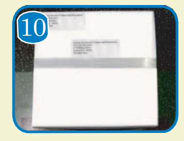
Secure the outer container lid with filamentous shipping tape. Place your return address in the upper left-hand corner of the shipper top and put the CDC Laboratory receiving address in the center.