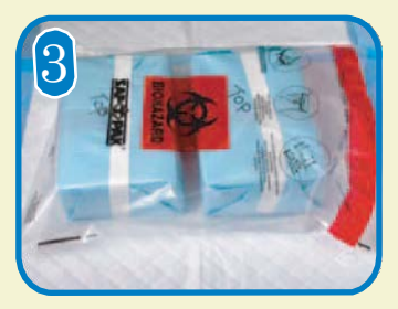
Wrap the box with absorbent material and secure with tape. Seal the box inside a Saf-T-Pak inner leak-proof polybag (or equivalent).