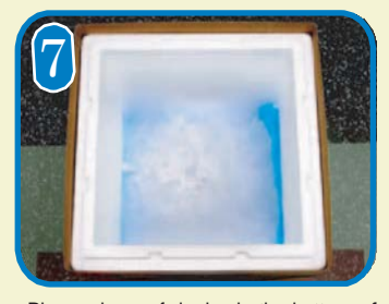
Place a layer of dry ice in the bottom of the shipper on top of the absorbent material. DO NOT use large chunks or flakes of dry ice.