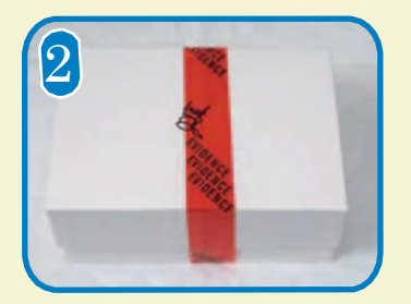
Use one continuous piece of evidence tape to seal the gridded box or the box containing wrapped urine cups. Write initials half on the evidence tape and half on the box.