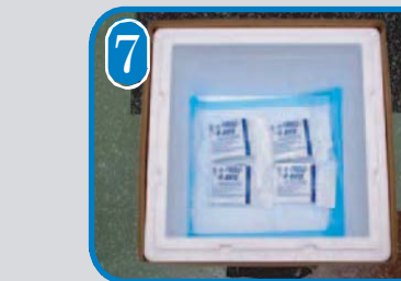
Place refrigerator packs in a single layer on top of the absorbent material.