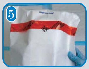
Seal the opening of this envelope with a continuous piece of evidence tape. Write initials half on the evidence tape and half on the envelope.

Place the blood shipping manifest in a sealable plastic bag and put on top of the sample boxes inside the shipper. Keep your chain-of-custody documents for your files. Place lid on the shipper.