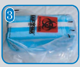
Wrap gridded box in absorbent pad and tape to seal. Seal gridded box inside a Saf-T-Pak clear inner, leak-proof polybag (or equivalent).