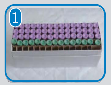
Place purple- and gray- or green- top tubes by patient number into a gridded box lined with an absorbent pad.

Guidance in Accordance with Packaging Instructions International Air Transport Authority (IATA) 650 Biological Substance Category B. See "Chemical Agents: Shipping Instructions for Specimens Collected from People who May Have Been Exposed to Chemical Agents" http://emergency.cdc.gov/labissues/specimens_shipping_instructions.asp