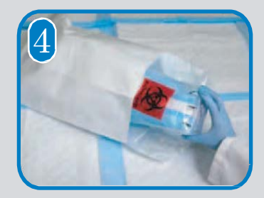
Place the sealed Saf-T-Pak inner leakproof polybag (or equivalent) inside a white Tyvek ® outer envelope (or equilvalent).

Use cushioning material to minimize shifting while box is in transit. Place additional refrigerator packs on top of samples.