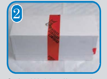
Seal gridded box with one continuous piece of evidence tape. The individual making the seal must initial half on the tape and half on the packaging.