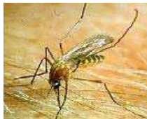
Encephalitis Mosquito Culex tarsalis

The “encephalitis” and “southern house” mosquitoes are most active during the early morning and early evening hours. These mosquitoes are unable to fly more than a few feet from where they are born. They lay their eggs in small pools of standing water so they are sometimes called “container” mosquitoes. These Culex mosquitoes go from egg to an adult in four to ten days during hot summer months. Adults live for about three weeks. They bite and feed on birds more often than people. These mosquitoes can transmit West Nile virus to humans if they have fed on an infected bird.