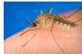
Southern House Mosquito Culex pipiens quinquefasciatus