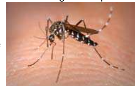
Asian Tiger Mosquito

The Asian tiger mosquito is a rare carrier of West Nile virus and may be associated with the transmission of Zika virus. Zika is primarily spread through the bite of another infected mosquito, the Aedes aegypti . The Aedes aegypti are often found in the gulf coast states and are not typically found in Oklahoma. Asian tiger mosquitoes are known as pest mosquitoes and are aggressive daytime biters. They are black and gray with white stripes and their numbers increase after a flood has occurred. They are most active in the early morning to late afternoon. Asian tiger mosquitoes were first found in Oklahoma in 1990. They can live in a broad range of climates and conditions. They can live in shade or sunny areas. They breed in small pools of standing water and go from being an egg to an adult in 24 days during hot summer months.